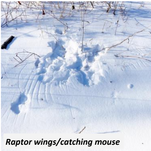
Raptor wings/catching mouse

Animal tracks come in all shapes and sizes. From the tiniest mouse, to the largest deer, all animals leave a trace one way or another. Familiarizing yourself with these tracks, will open up a whole new world waiting to be explored. Many great resources exist to learn from, whether it be a book, online, or through a class. Once you know what you're looking at, everything else will make more sense.