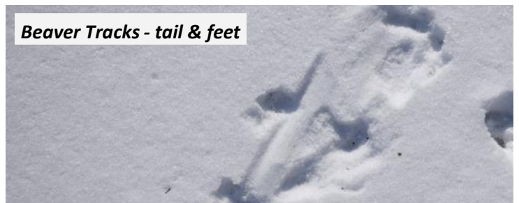
Beaver Tracks - tail & feet

As we embrace winter and everything that comes with it, make an effort to notice the story being told in the snow. Tracks are all around us in nature. Following a trail of prints will give you a whole new perspective into the happenings of the natural world.