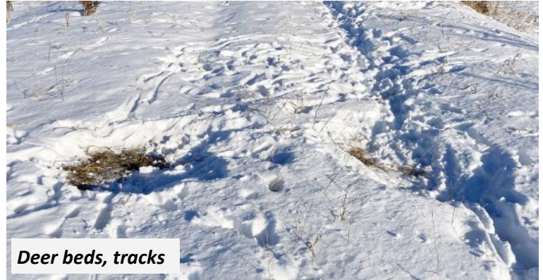
Deer beds, tracks

Animal tracks can also give us insight into repeated behaviors and patterns. Arguably the most easily seen