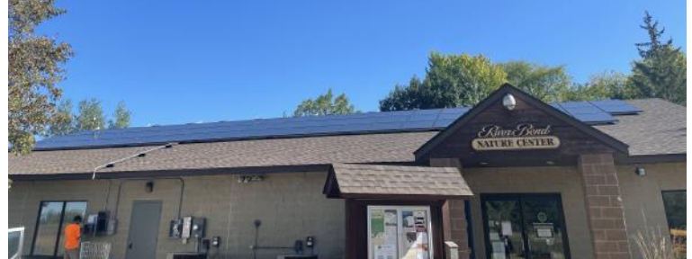
Solar Panel Array installed at River Bend, September 2024