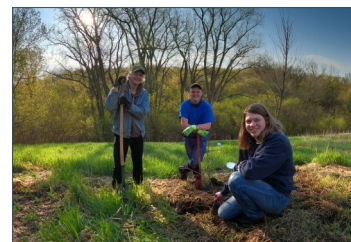
Faribault HS Biofield Internship at RBNC