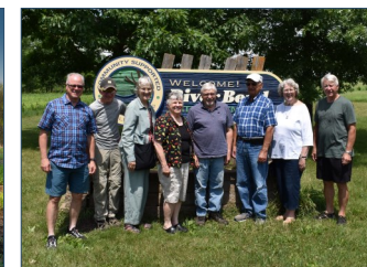
2020 Volunteers - Most Hours