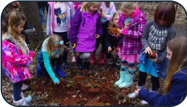
Students learning about a decaying log

What a great year we had at River Bend Nature Center teaching more than 6,600 students outdoor nature education. School field trips bring in students locally from Faribault to Northfield and as far as Mankato and New Prague! Thank you for visiting River Bend Nature Center this year! We had a blast teaching your students. Our staff of naturalists teach Pre-K - 8th Grade with classes aligned with MN State Science Standards. They are fun, interactive with hands-on experiences in nature! Getting students outdoors helps stimulate their learning and creates memorable moments that last a lifetime. We've been doing school field trips since 1978 and we are now seeing the next generations come through our trails. Our classes talk about plants, animals, life cycles, ecosystems, fossils, weathering and erosion, and more! Visit our website rbnc.org for more information. Call or email to schedule a field trip. We are taking reservations for 2022-2023. Give your child or student an experience they will talk about for years to come!