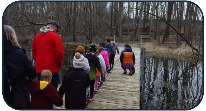
Visiting Turtle Pond, a favorite location for every student