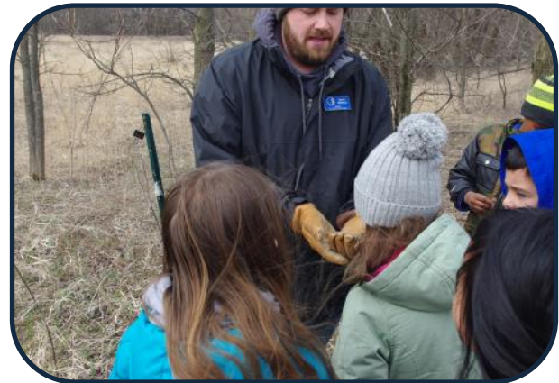
In the field exploring the prairie.