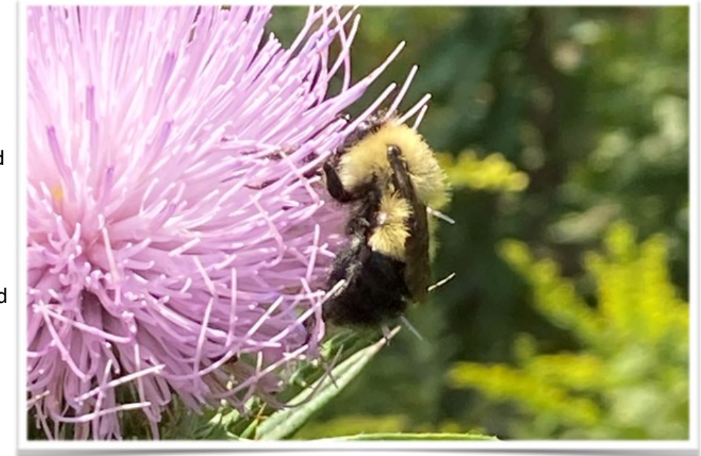
Photo of Bombus affinis, Queen on thistle

The Bumble Bee has a busy life humming and buzzing from flower to flower. In the spring a lone female, or Queen Bee, emerges from its nest to start foraging for pollen and nectar. She has a lot to accomplish. A queen bumble bee is impregnated with eggs from the fall. She alone will start a new colony of bees, building a nest, laying eggs, and foraging for food until the first generation of worker bees are born and take over the work of collecting food and tending to the nest.